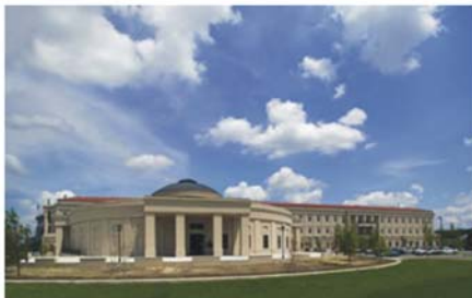
View of Energy, Coast & Environment Building from Nicholson Drive Extension

Parking: On-campus parking (directly west of the building as you come from Nicholson Drive Extension) has been arranged. You will need to tell the parking attendant that you are attending the symposium.